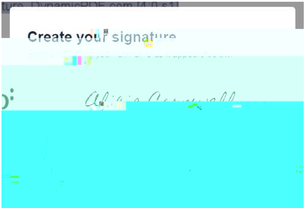
"Create your signature."